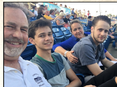
2017 WH Night at Captains game